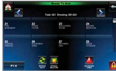
Zone List Screen